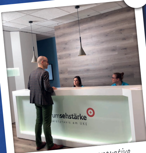
Checking in for my preoperative LASIK assessment.