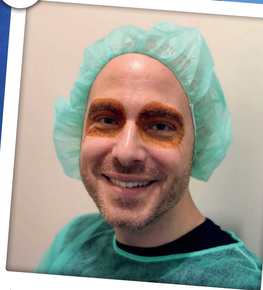
I am excited and ready to start.