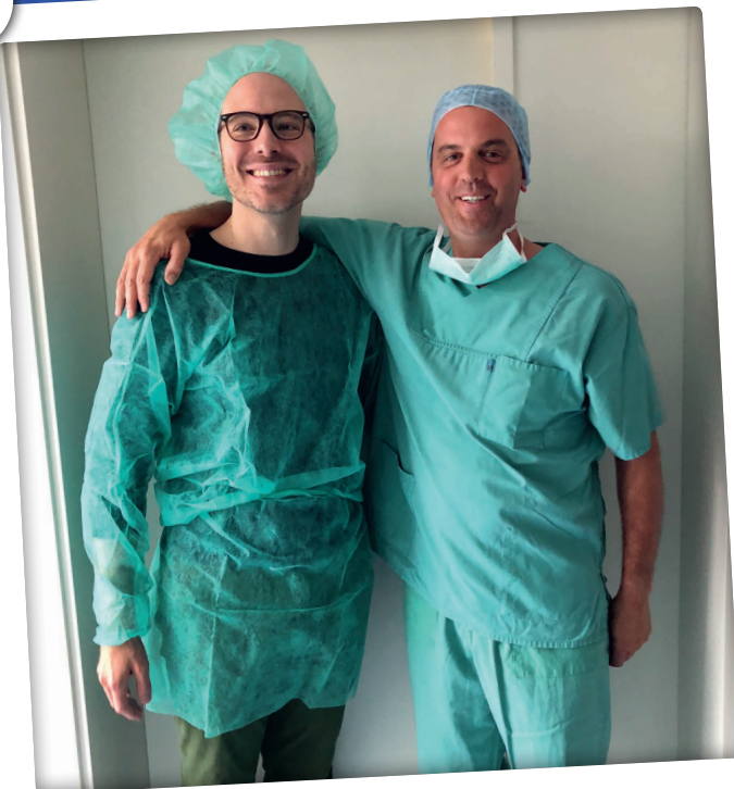
Wow! This is really happening... I am getting rid of my glasses.